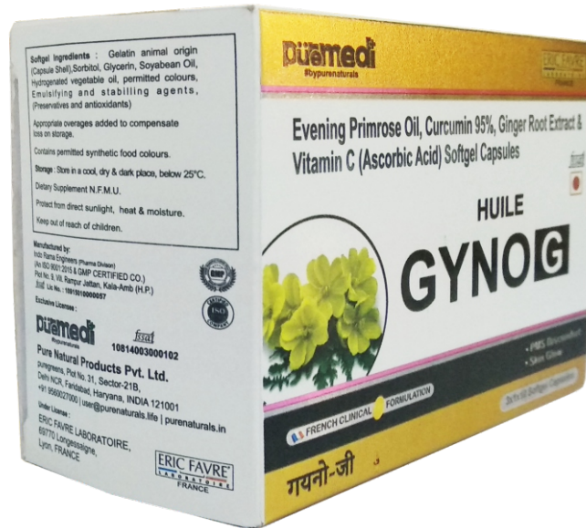
3x10 Softgel Capsules