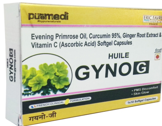
1x10 Softgel Capsules

Appropriate overages added to compensate loss on storage.